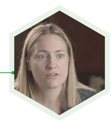
INTERACTIVE BEHAVIOURAL CASE STUDY LEARNING MODULES